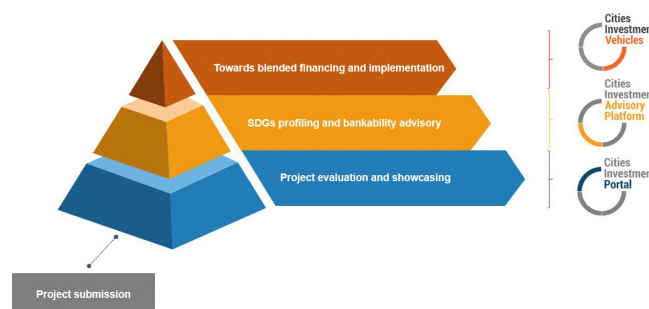
Figure 1: The Structure of CIF

In February 2020 CIF showcased nine projects at the 10th Session of the World Urban Forum (WUF10) in Abu Dhabi. Of these nine CIF facilitated feasibility studies and investor discussions for six, three of which are now close to finalising investment deals. CIF recently acquired a further thirty-eight project submissions through an internal open call which are currently undergoing evaluation before prior to being onboarded to the CIF pipeline.